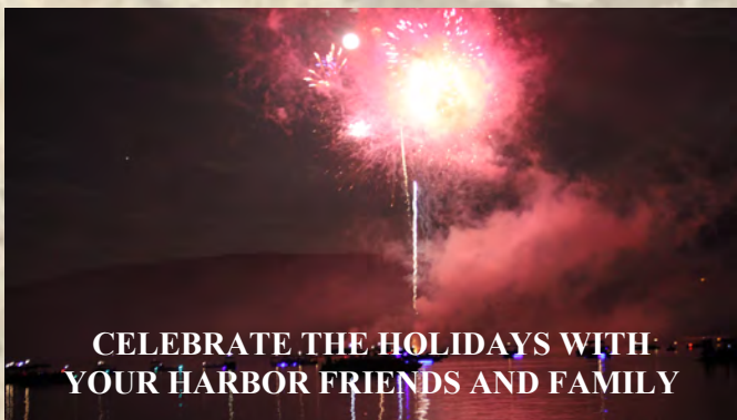
CELEBRATE THE HOLIDAYS WITH YOUR HARBOR FRIENDS AND FAMILY