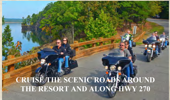
CRUISE THE SCENIC ROADS AROUND THE RESORT AND ALONG HWY 270