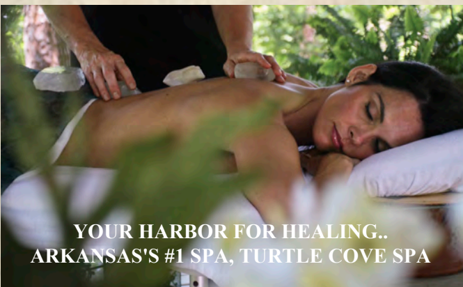
YOUR HARBOR FOR HEALING.. ARKANSAS'S #1 SPA, TURTLE COVE SPA