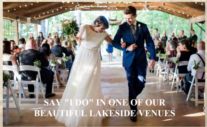
SAY "I DO" IN ONE OF OUR BEAUTIFUL LAKESIDE VENUES