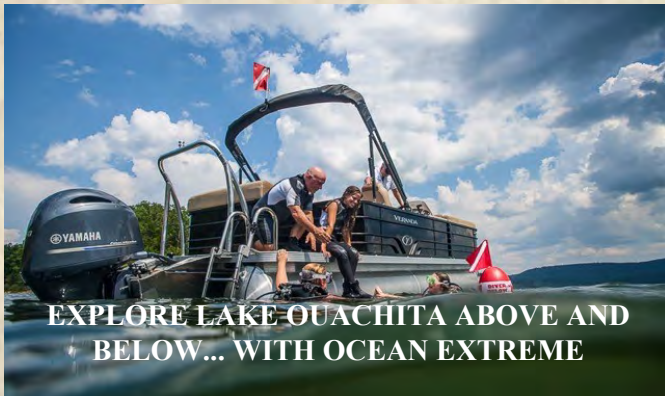
EXPLORE LAKE OUACHITA ABOVE AND BELOW... WITH OCEAN EXTREME