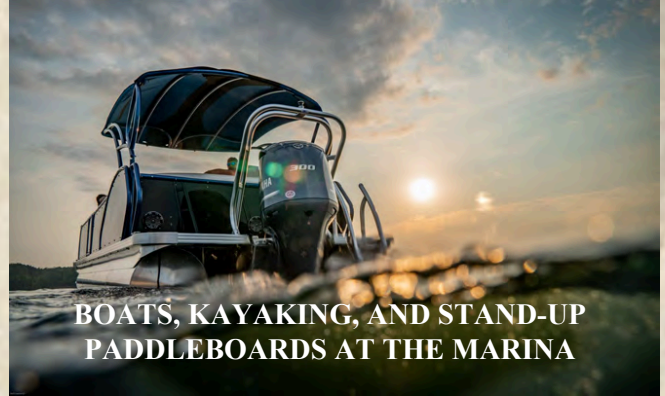
BOATS, KAYAKING, AND STAND-UP PADDLEBOARDS AT THE MARINA