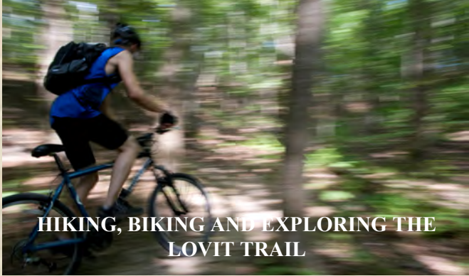
HIKING, BIKING AND EXPLORING THE LOVIT TRAIL